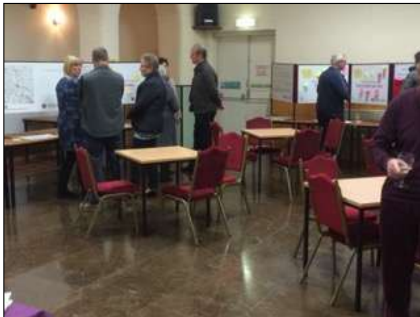
Business Consultation Event (March 17 th )