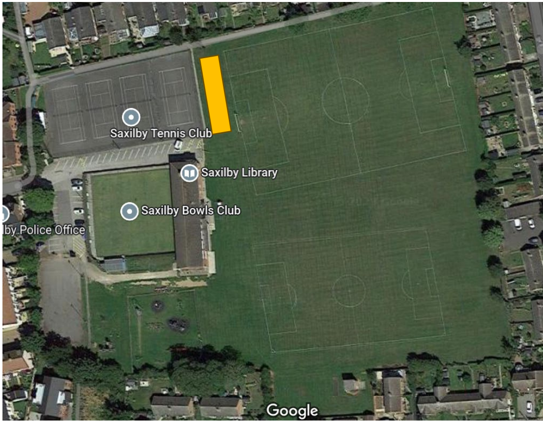
Map showing site of proposed net system.