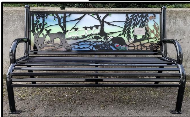
Wildlife Bench Seat £1,395 +VAT Delivery £125+VAT + fixings