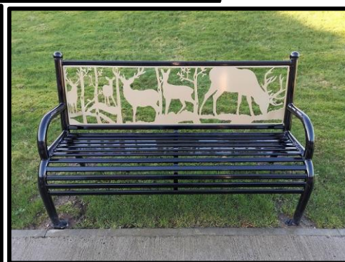
Deer and Stag Bench Seat £1,395 +VAT Delivery £125+VAT + fixings

A bespoke bench would be out of budget at £3,200+VAT + Delivery £125+VAT